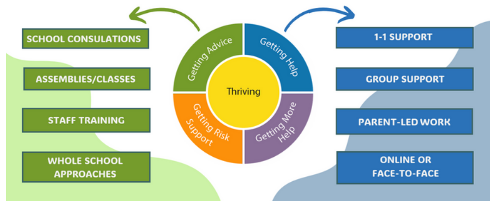
This slide gives an overview of key elements of an EMHP role, linking to the THRIVE Framework for system change .