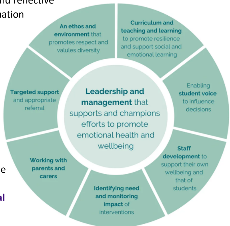
The Eight Principles of Whole School Approach

More information about WSA can be found in the document “Promoting children and young people’s mental health and wellbeing: A whole school or college approach.”