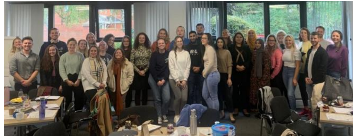
Associate Psychological Practitioners (APPs) with the University of Central Lancashire